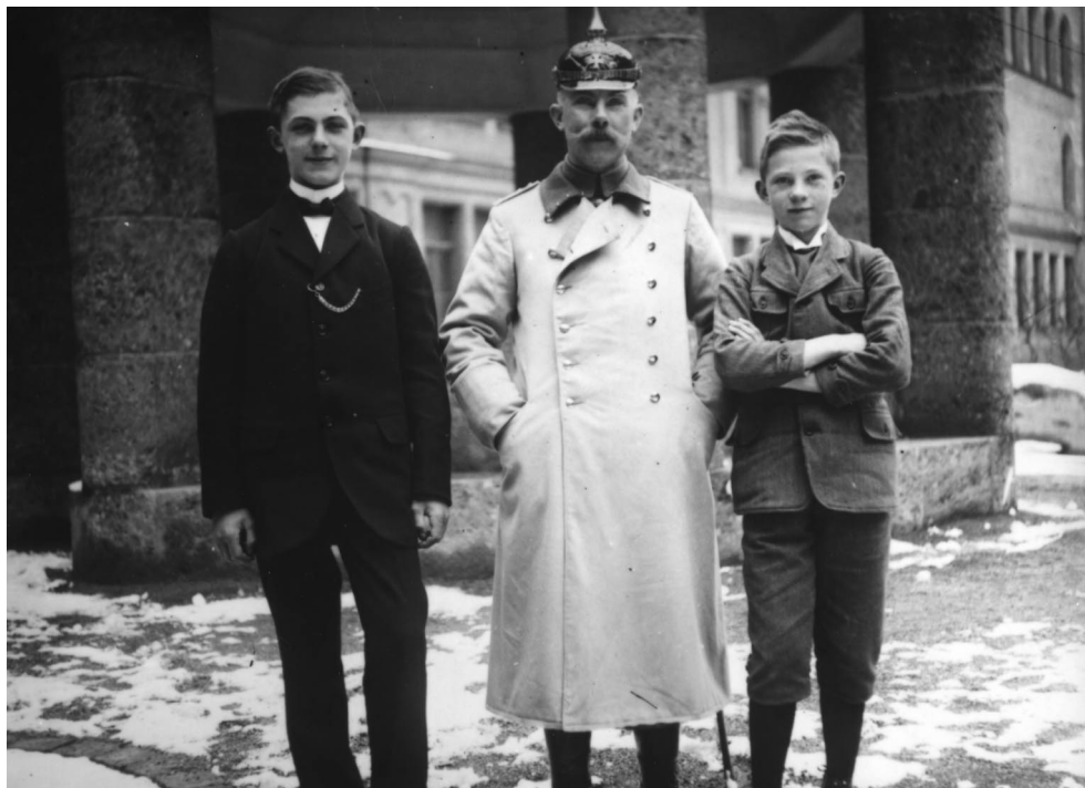
FAMILY PHOTO showing Heisenberg (right) with his father and brother in 1914.

fulfill the duties and tasks that life presents to us without asking too much about the why or the wherefore . . . And then we should wait for whatever happens . . . reality is transforming itself without our influence. 8